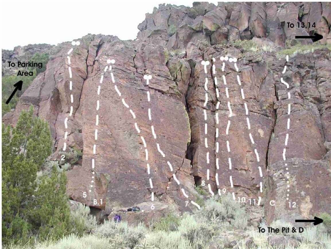
Figure 1: Gallows Edge