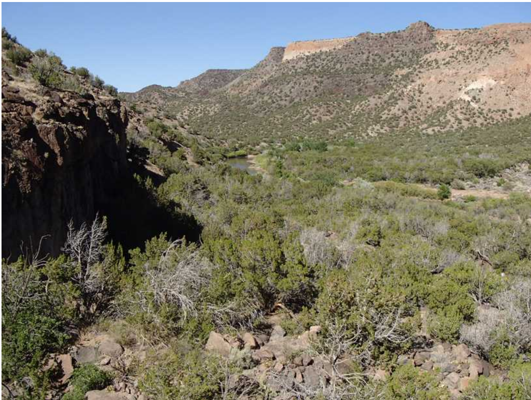
Looking upstream. The cliff appears to break down in this direction, although I did not explore this area further.