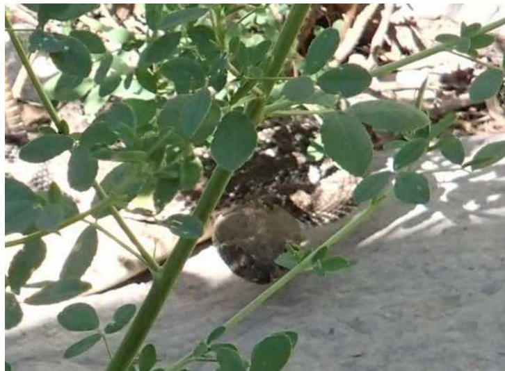
Enlargement of the business end of my rattlesnake.