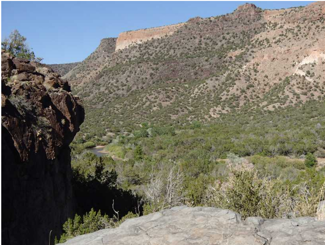
View looking upstream, while standing at the pour off.