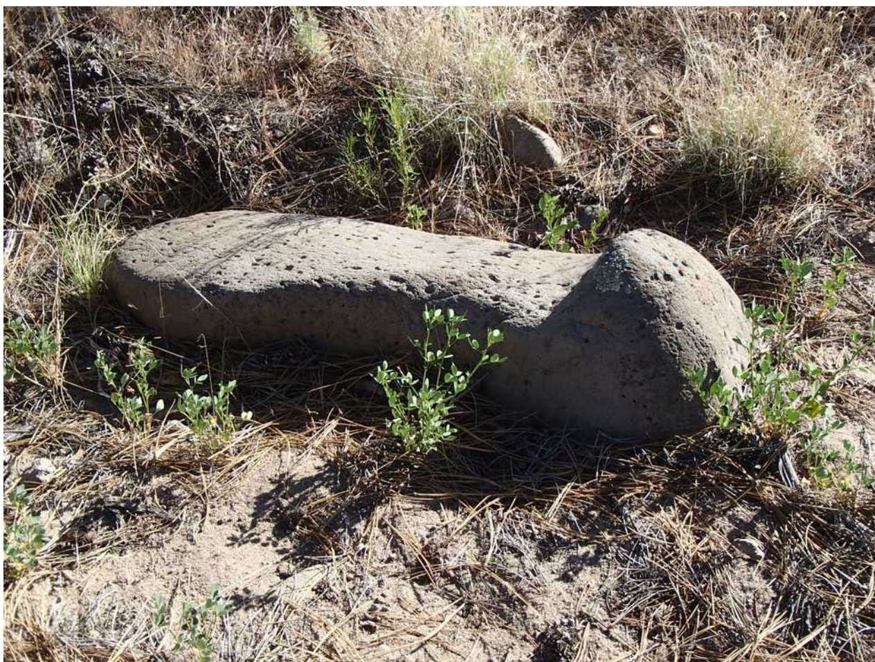
Interesting monolith by the main footpath. Could it be a human-shaped stone?

This is an enjoyable hike. I started at 2 PM and finished at 7 PM.