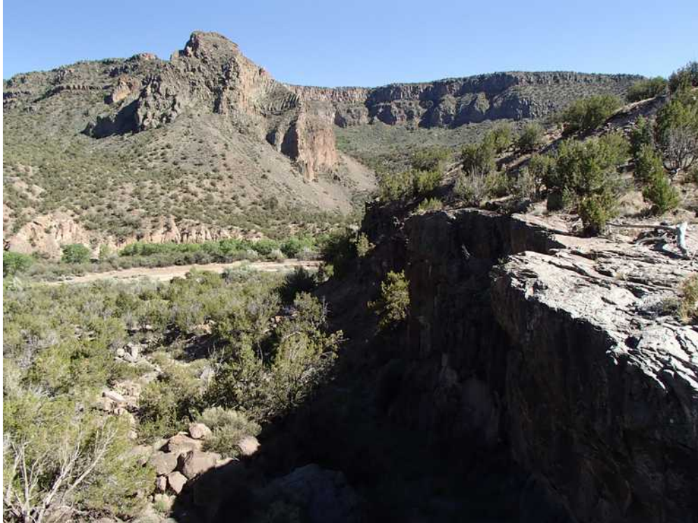
Looking downstream. I estimate the cliff at 30 feet.