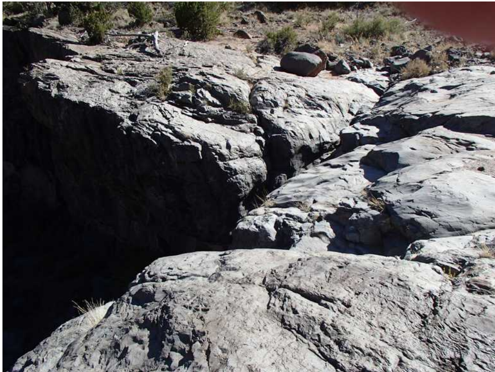
Photo of the smooth gray rocks at the edge of the pour off. The cliff is to the left. The cleft in the cliff for the watercourse does not appear to offer a downclimb. I think it would yield to a partner with a rope.