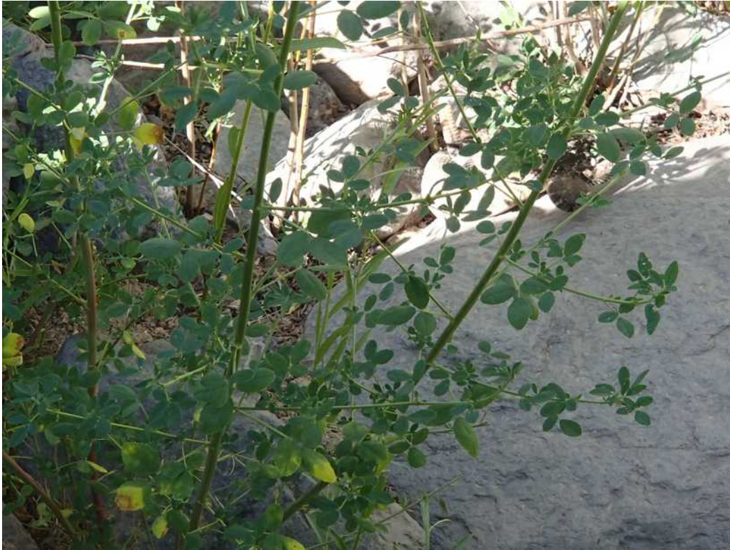
Rattlesnake near the willow grove. View blocked by alfalfa.

On my return, as I was crossing the drainage and after emerging from a willow grove, I heard loud and insistent rattling. My legs backed me away, automatically. I returned to obtain a photo, before proceeding up a rockfall on my side of the drainage.