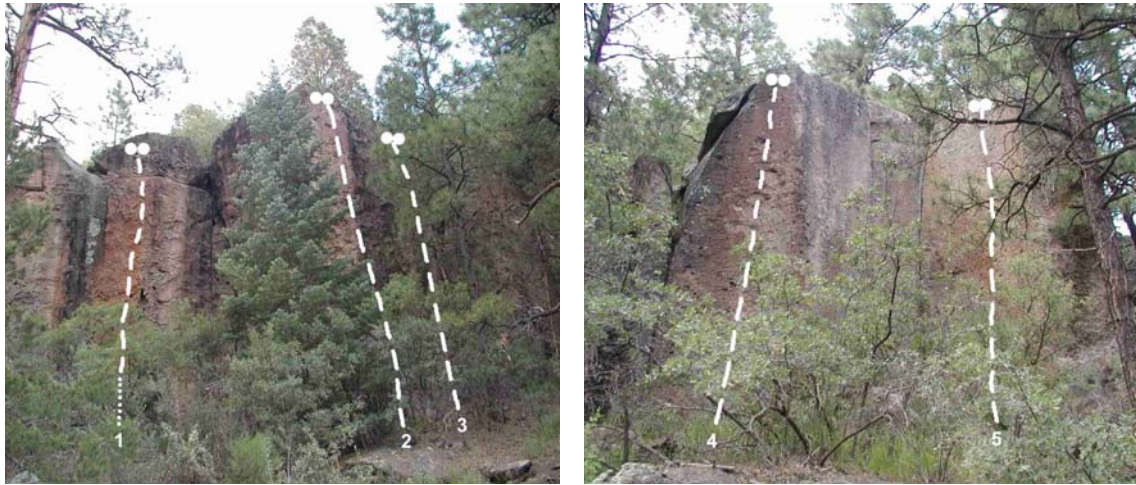
Figure 3: Hospital Crag