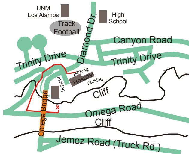
Figure 1: Directions to the Hospital Crag.

Drive up the Main Hill Road (highway 502) and into Los Alamos (Trinity Dr.). Continue through three traffic lights, then take a left at the fourth traffic light onto Diamond Dr. At the next light (after 50m) turn left again into the parking lot of the medical center and park here. Don't park in the canyon. You might not be allowed to be there. Cross over Diamond Drive and walk down to Omega Road on the pedestrian way and a small trail. Turn left on the road and after the bridge left again to the cliff. You can access the cliff from above as well, but then you have to bushwhack your way on steep and loose slopes. We strictly recommend the described way.